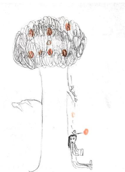
Figure 3 Representation of Isaac Newton.