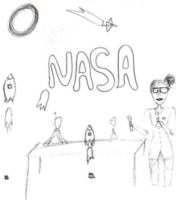
Figure 2 Representation of a female NASA scientist.