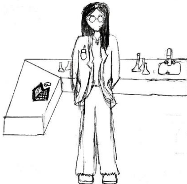
Figure 5 Representation of a female scientist.