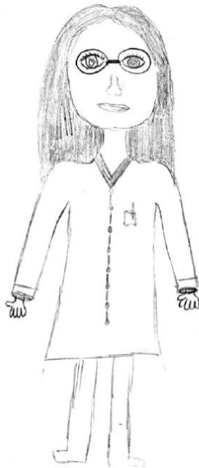
Figure 4 Representation of a female scientist.